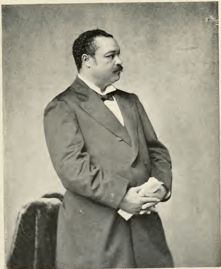
HON. B. K. BRUCE United States Senator, 1873-1881